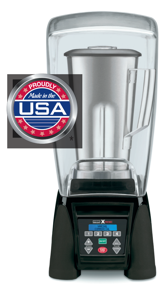
*Made in USA with US and foreign parts.