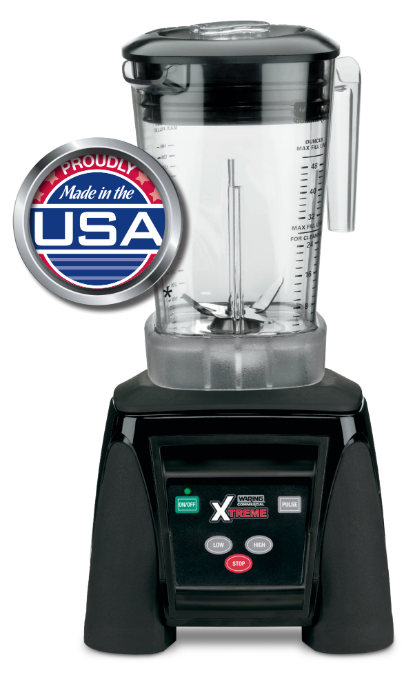
*Made in USA with US and foreign parts.