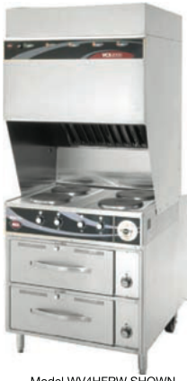
Model WV4HFRW SHOWN