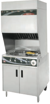
Model WV4HS SHOWN