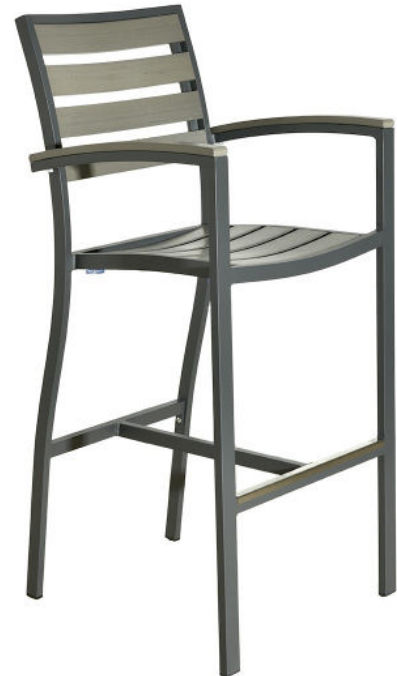
Antracite / Grey 516B-PW-GA