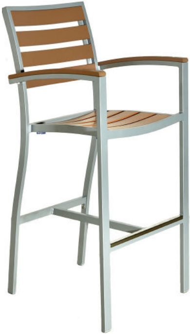
Silver / Teak 516B-PW-TS