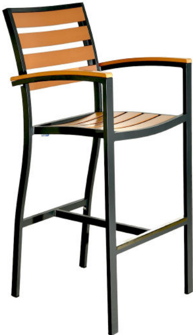
Antracite / Teak 516B-PW-TA