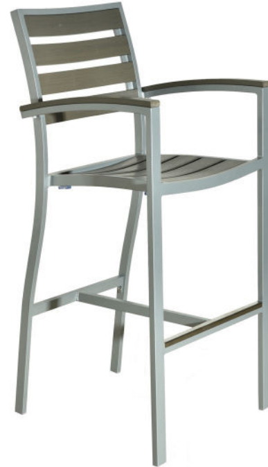
Silver / Grey 516B-PW-GS