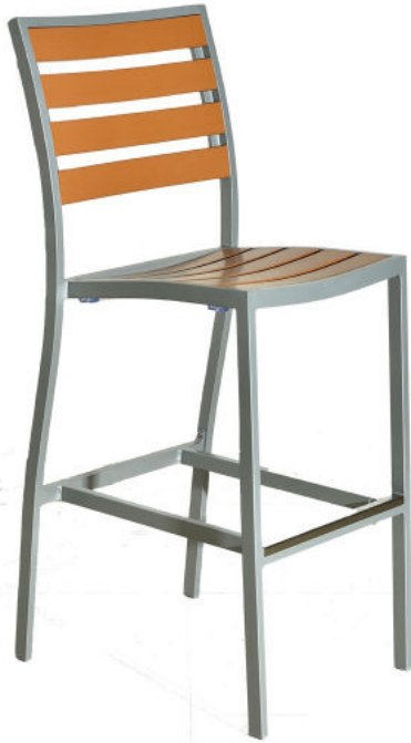
Silver / Teak 517B-PW-TS