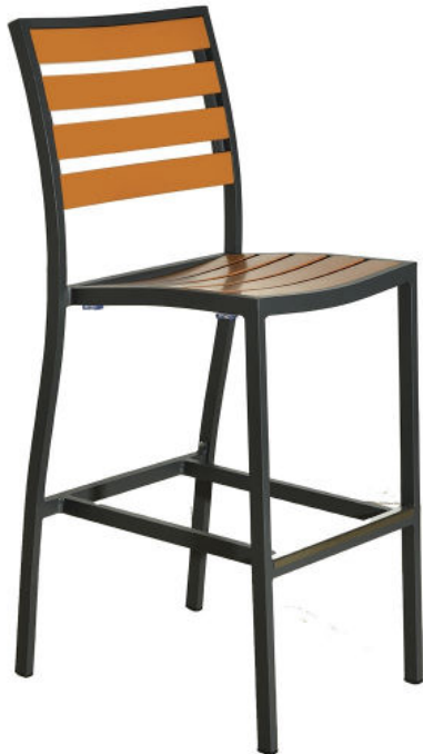
Antracite / Teak 517B-PW-TA