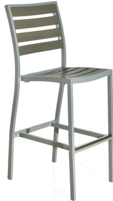
Silver / Grey 517B-PW-GS