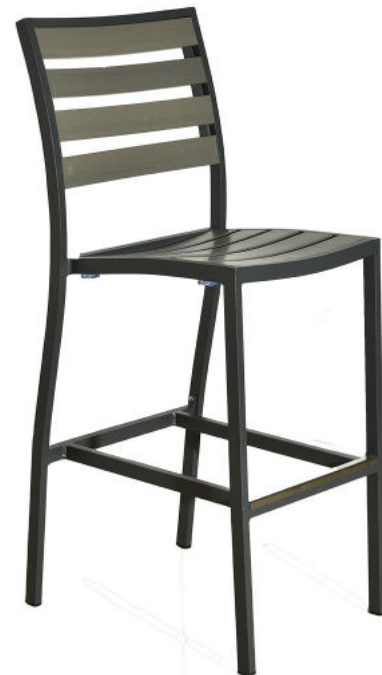
Antracite / Grey 517B-PW-GA