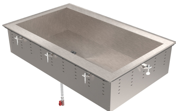
Short Side Non-Refrigerated Cold Pan Drop-in