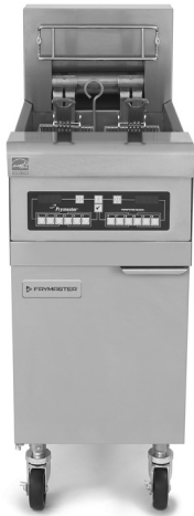
RE14 Shown with optional casters