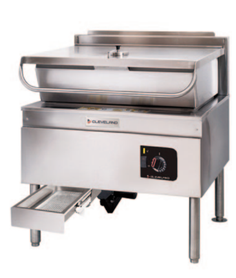
Open base model with optional Drain Drawer shown