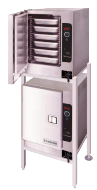
Shown with optional Cafeteria Pans