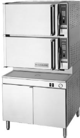
Shown with optional Electronic Timer