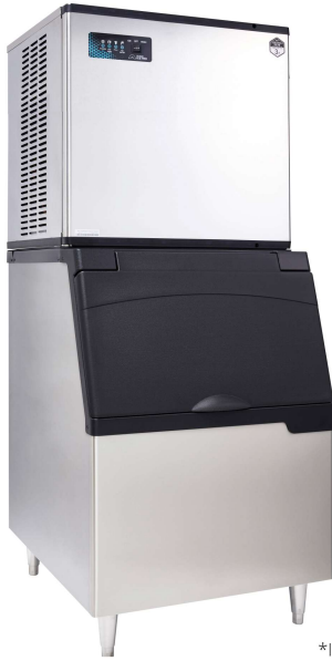
ICETRO IM-0750 ice machine on a IB-044 bin