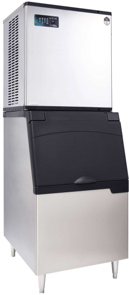
ICETRO IM-0460-22 ice machine on a IB-026-22 bin