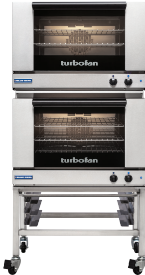
Model E27M3/2C shown

Double Stacked on a Stainless Steel Base Stand