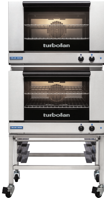
Model E27M2/2C shown

Double Stacked on a Stainless Steel Base Stand