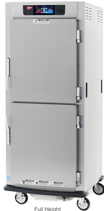
Full Height Dutch Solid Doors