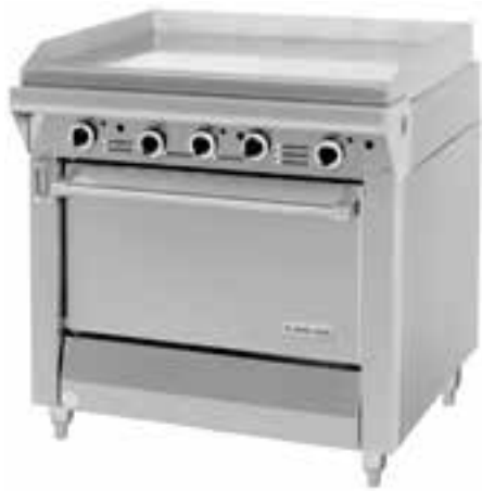
Model M47R Valve Controlled Griddle Top Range