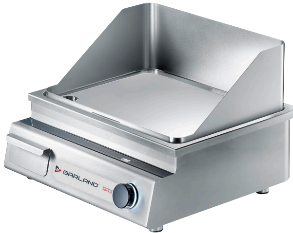
INSTINCT Griddle 3.5/5