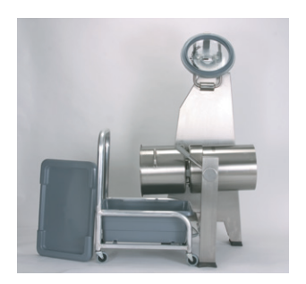
FOOD CART SHOWN WITH VCM