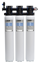
SYSTEM, WQ-TRPL60 (10.5).2CL