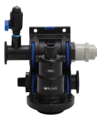
HEAD ASSEMBLY, WEQ- SINGLE W/QC CONNECTOR