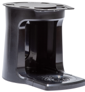
NON-LOCKING STAND ASSY, TF SERVER GEN3