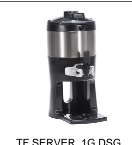
TF SERVER, 1G DSG