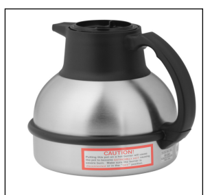
THERMAL CARAFE,ORN 1.9L 12PK