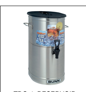
TDO-4, RESERVOIR BREW THRU