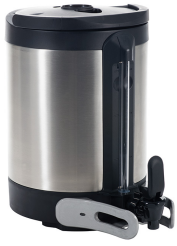
SH SERVER, 1.5G/5.7L INF SERIES