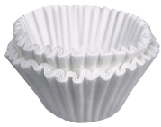
FILTERS, GOURMET 500 500/1 50/CL