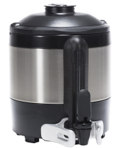
TF SERVER, 1G MECH GEN3 NOBASE