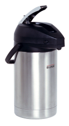
AIRPOT, 3.0L SST LA SINGLE PK