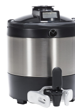
TF SERVER, 1G DSG GEN3 NOBASE