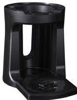
STAND ASSY KIT, TF SERVER