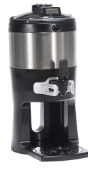
TF SERVER, 1G DSG GEN3