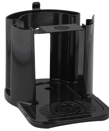
STAND ASSY, TF SERVER