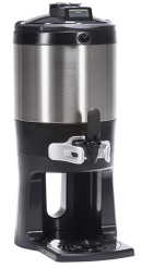
TF SERVER, 1.5G DSG GEN3