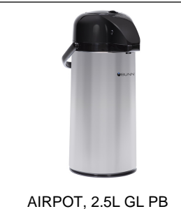
AIRPOT, 2.5L GL PB SINGLE PK