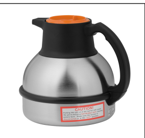
THERMAL CARAFE,ORN 1.9L 1PK