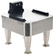
1SH STAND, 120V INF SERIES