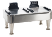
2SH STAND, 120V INF SERIES