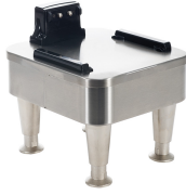
1SH STAND, 120V INF SERIES