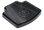
KIT, DRIP TRAY SINGLE SH