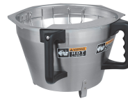
FUNNEL ASSY W/ BASKET, TITAN