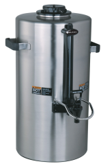
TITAN TF SERVER