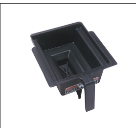
FUNNEL W/DECAL,PPK NAR BLK(LG)