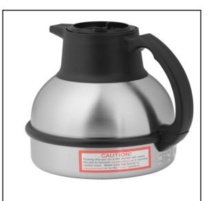
ACC,1.9L THERMAL CARAFE SST