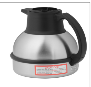
THERMAL CARAFE,ORN 1.9L 12PK