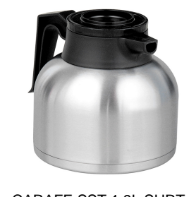
CARAFE,SST 1.9L SHRT BLK 1