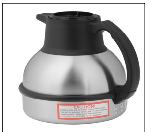
THERMAL CARAFE, BLK 1.9L 12PK