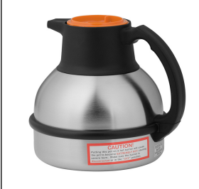
THERMAL CARAFE,ORN 1.9L 1PK