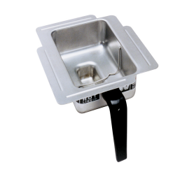
FUNNEL ASSY, SST-PP BLK HNDL