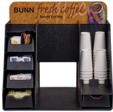
MERCHANDISER, STD HEADER-POD