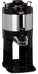
TF SERVER, 1G/3.8L MECH