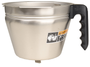
FUNNEL ASSY, W/ INSERTS SMTF