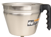
FUNNEL ASSY, W/ INSERTS SMTF