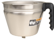
FUNNEL ASSY, W/ INSERTS SMTF