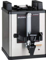
SH-S SERVER 1G 60 MIN ADJ TMR