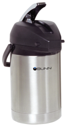
AIRPOT, 2.5L SST LA SINGLE PK