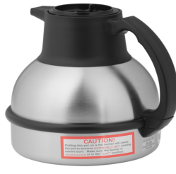
ACC,1.9L THERMAL CARAFE SST