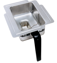
FUNNEL ASSY, SST-PP BLK HDL