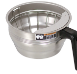
FUNNEL ASSY, SST-BLK HDL(7.12)