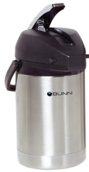
AIRPOT, 2.5L SST LA 6/ CASE