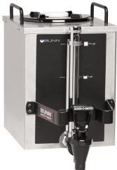
1.5GPR-FF, TOP HNDL