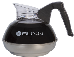
DECANTER, EASY POUR® BLACK-CANADA 1/CS