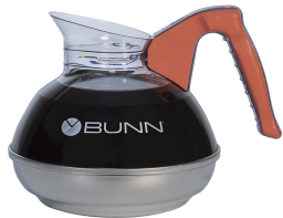
DECANTER, EASY POUR ORANGE-CANADA 1/CS