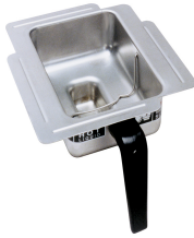
FUNNEL ASSY, SST-PP BLK HDNL