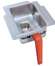
FUNNEL ASSY,SST-PP ORANGE HDL