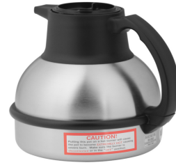
THERMAL CARAFE, ORN 1.9L 12PK