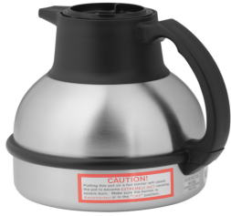
THERMAL CARAFE, BLK 1.9L 12PK