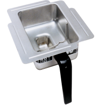
FUNNEL ASSY, SST-PP BLK HNDL