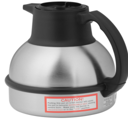
THERMAL CARAFE, BLK 1.83 L 1PK