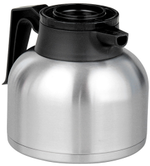
CARAFE, SST 1.9L SHRT BLK 1