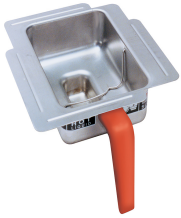
FUNNEL ASSY,SST-PP ORANGE HDL