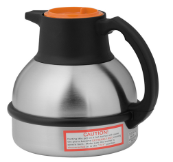
THERMAL CARAFE, ORN 1.9L 1PK