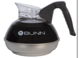
EASY POUR®,(BLK) 12/ CS