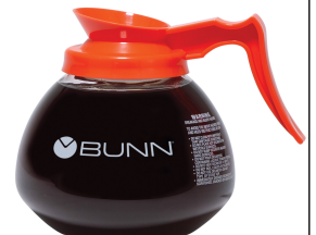
DECANTER, GLASS- ORN 12 CUP 1PK