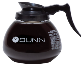
DECANTER, GLASS-BLK 12CUP 1PK