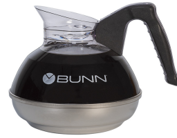
EASY POUR®,(BLK) 6/CS