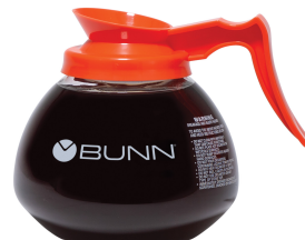
DECANTER, GLASS-ORN 12C 24/CS