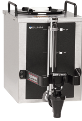
RESERVOIR, GPR1.5 FST/FCT TOP HANDLES