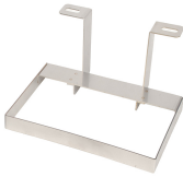
BRACKET WLDMT, DRIP TRAY RWS1