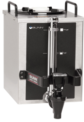
1.5GPR-FF, TOP HNDL